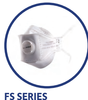
Part # 209335