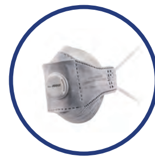
F SERIES FFP2 NR D OV Part # 209227