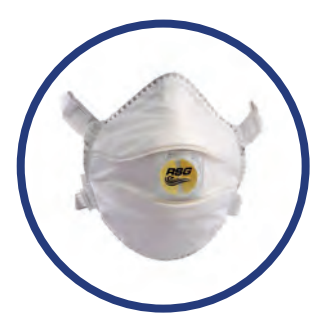
C SERIES FFP3 NR D V