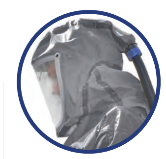
T-AIR 1000 CHEM3 Part # 614052