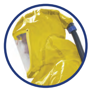
T-AIR 1000 CHEM1 Part # 614051